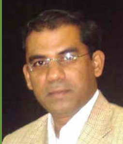
Ashutosh A.T. Pednekar (IAS) Commissioner

It is our collective endeavor to excel in all areas of the activities in capacity of city managers to enable this historic city, which is better known as 'The Pink City' world over, to attain greater heights of civic administration. We want to perform moving along with all the stake-holders to create a synergy of hope.