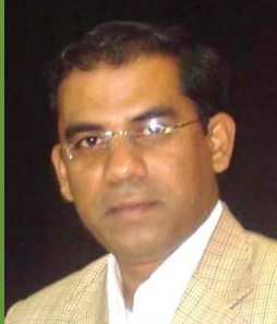
Ashutosh A.T. Pednekar (IAS) Commissioner

It is our collective endeavor to excel in all areas of the activities in capacity of city managers to enable this historic city, which is better known as 'The Pink City' world over, to attain greater heights of civic administration. We want to perform moving along with all the stake-holders to create a synergy of hope.